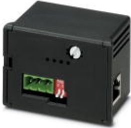
Gateway RS-485/Ethernet communication module for EEM-MA600

Please be informed that the data shown in this PDF Document is generated from our Online Catalog. Please find the complete data in the user's documentation. Our General Terms of Use for Downloads are valid ( http://download.phoenixcontact.com )