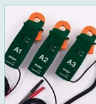
Model PQ34-2 200A Current Clamp Probes with 0.8" (19mm) jaw size

Choose the best clamp probes to fit your application needs ranging from 200A to 3000A and flexible vs traditional jaw type.