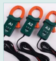
Model PQ34-12 1200A Current Clamp Probes with 2" (50mm) jaw size