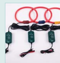
Model PQ34-30 3000A (24"/600mm) Flexible Current Clamp Probes for wrapping around busbars